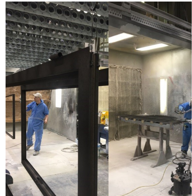
BRONZE COATING IN THE FACTORY

The right sealer coats can be hand-applied on site after cleaning the Bronze surface as part of an established maintenance regime. It's not a technically demanding feat of alchemy and you won't need a team of mad scientists in tin foil hats.