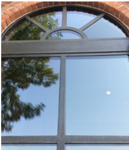
NATURAL AGED PATINA ON BRONZE WINDOW