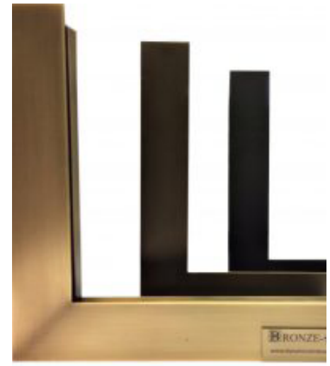
STANDARD PATINA FINISHES ON BRONZE WINDOW PROFILES