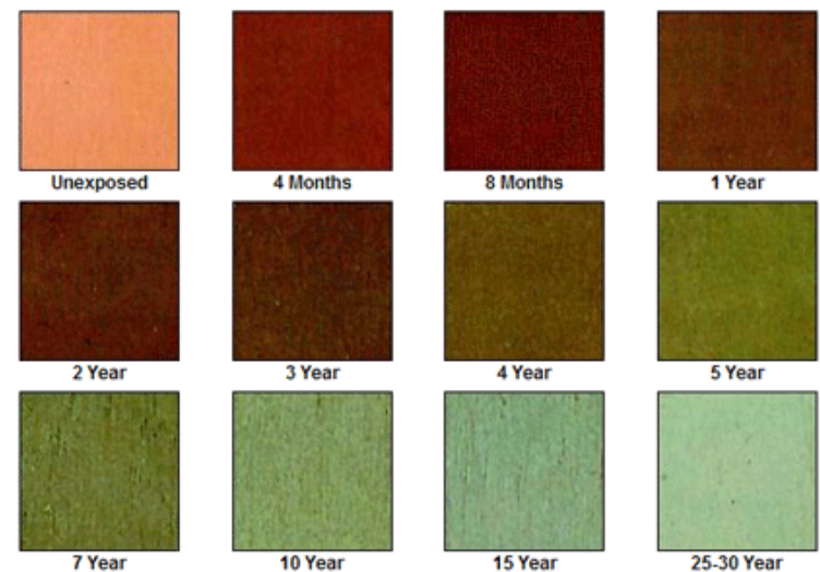
COPPER WEATHERING CHART: AN EXAMPLE OF THE NATURAL WEATHERING OF COPPER (ONE OF THE COMPONENTS IN ARCHITECTURAL BRONZE)

As an alloy of several different compounds, architectural bronze will change at a different rate than standalone copper.