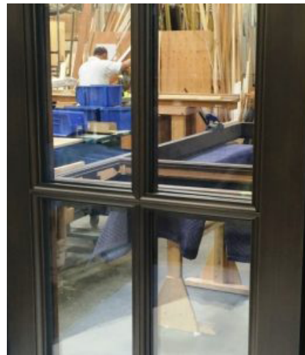
MEDIUM-DARK PATINA ON ARCHITECTURAL BRONZE