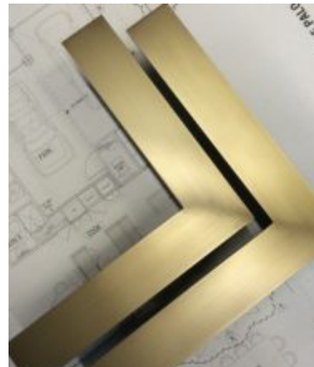
WELDING WITH LIGHT PATINA FINISHES